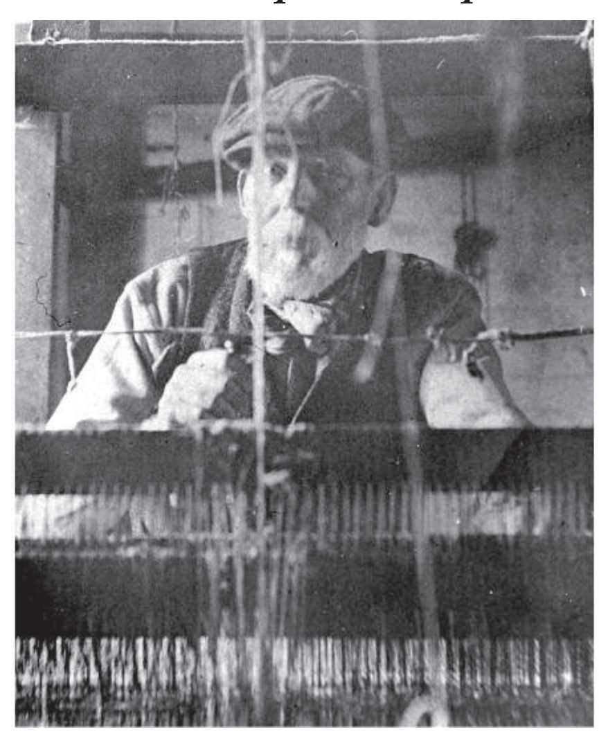
A HAND-LOOM WEAVER AND HIS LOOM ARE DIFFICULT TO PART!